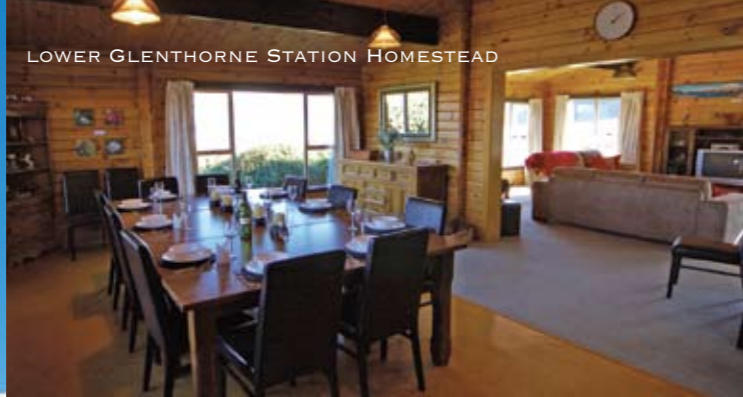
LOWER GLENTHORNE STATION HOMESTEAD