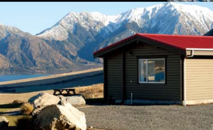
LOOKING TOWARDS PORTERS PASS SKI FIELD

Visit one of the earliest power stations that is still operating at the Lake Coleridge Village, a 20 minutes drive away.